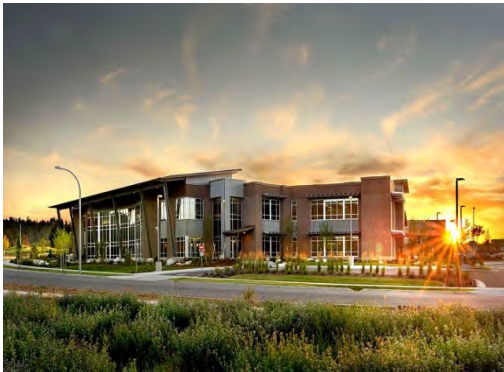
Ednetics Corp. HQ