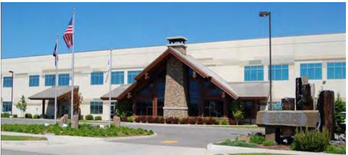
Buck Knives Corp. HQ